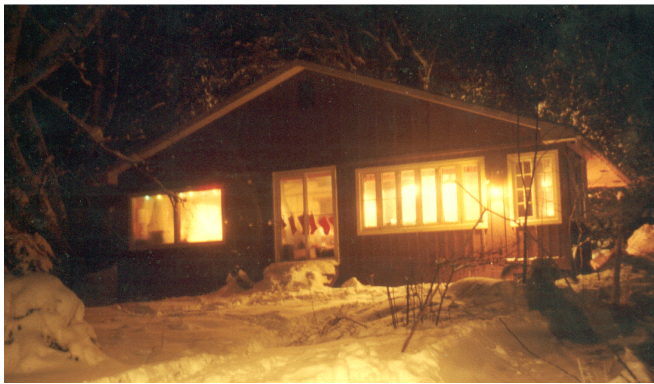
The cottage at Christmas