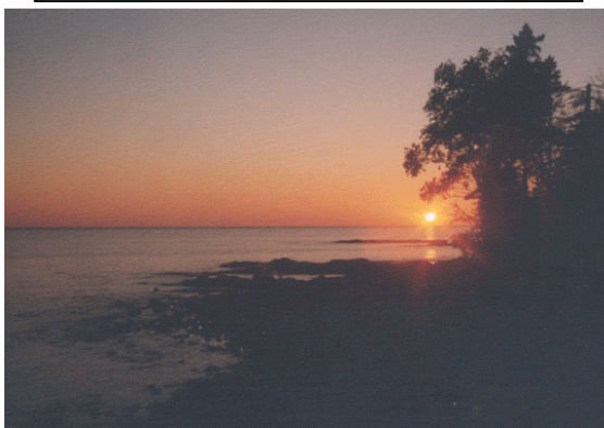
Sunset on Lake Superior