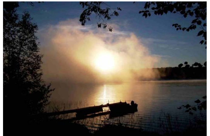
Mist at dawn