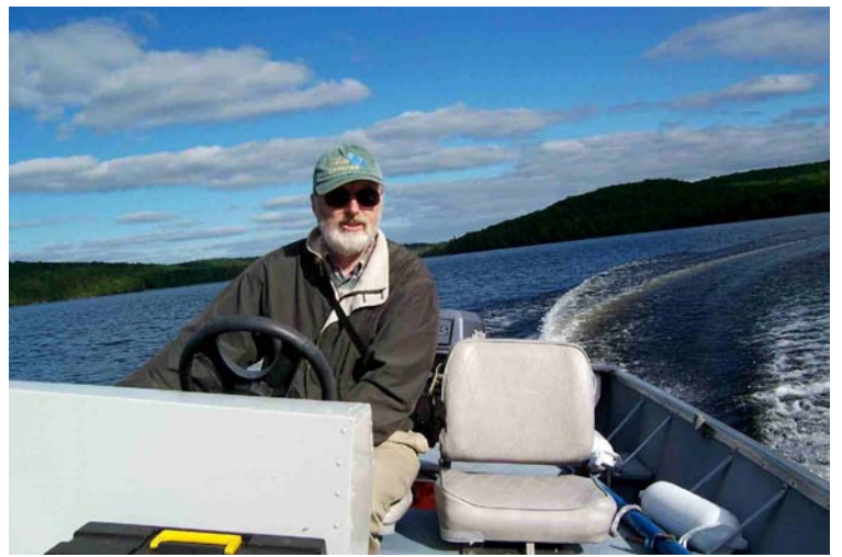
The ancient mariner?