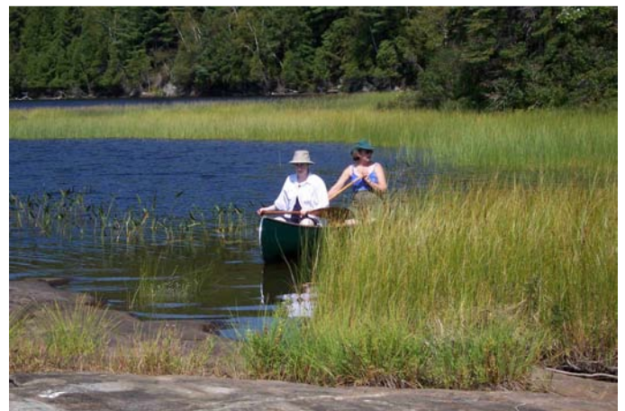
Canoeing in the reeds