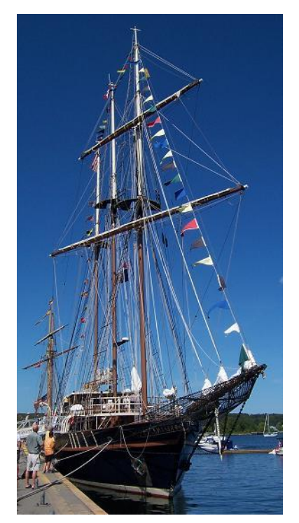
Tall ship in Midland